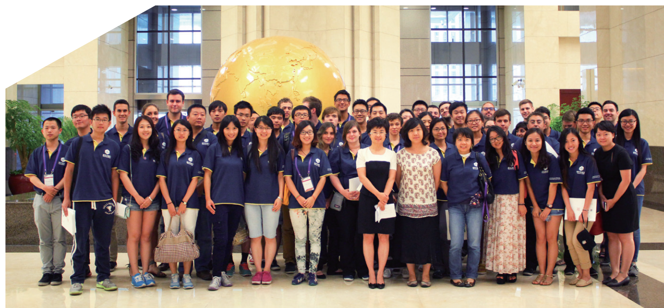
Visiting the Agricultural Bank of China