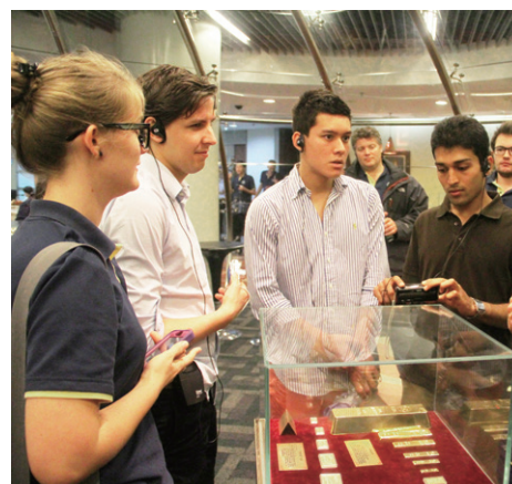
Visiting the Industrial and Commercial Bank of China