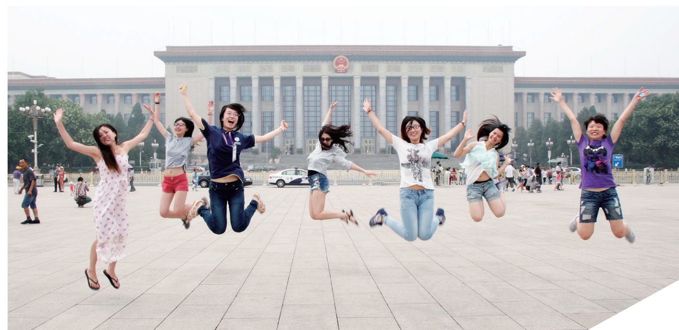
Touring the Tian'anmen Square