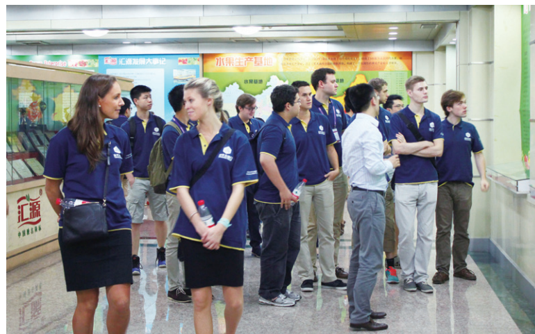
Visiting Huiyuan Group Corporation

Capitalizing on the School's close industry connections, attendees will have the chance to visit major financial institutions to gain first-hand knowledge of Chinese financial markets.