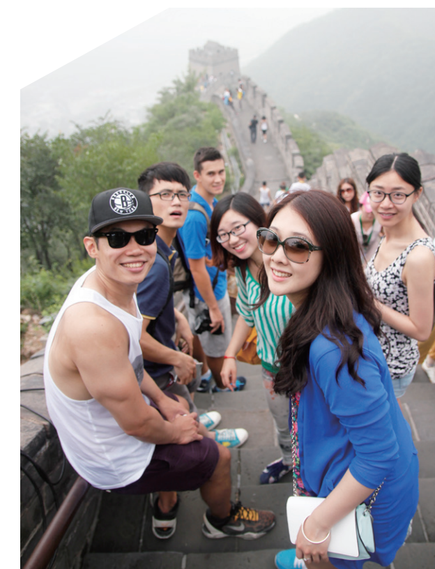
Touring the Great Wall

Additionally, cultural events and tours to popular local attractions will give the attendees a glimpse of the fascinating Chinese culture.