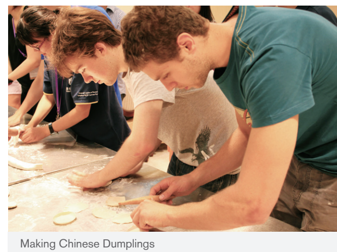
Making Chinese Dumplings

Additionally, cultural events and tours to popular local attractions will give the attendees a glimpse of the fascinating Chinese culture.